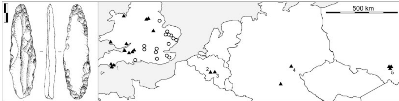
Fig. 5. Geographic distribution of LRJ sites (after Flas, 2006). Triangles = cave sites; circles = open air sites. Sites mentioned in the text: 1, Kent's Cavern; 2, Spy; 3, Goyet; 4, Ranis 2; 5, Nietoperzowa Cave. Left: Jerzmanowice point from Spy Cave (Royal Museums of Art and History collections).

The available chronological data for the end of the Mousterian in the Mosan Basin are rare, as is the case for north-