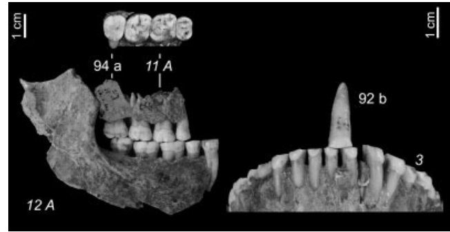
Fig. 2. Neandertal remains attributed to Spy I and II and directly dated in the present study. Left: Spy 94a, an upper right third molar with a small alveolar fragment attached that refits with maxilla fragment Spy 11A; right: Spy 92b, an upper left central incisor that articulates with the lower incisors on mandible Spy 3. Font code as in Figure 1.

Radiocarbon dating protocols. At the CIO, extraction of the collagen samples followed the procedure developed by Longin (1970), and the samples’ chemical pretreatment used standard procedures (Mook and Streurman, 1983). Samples dated at the ORAU using ultrafiltration