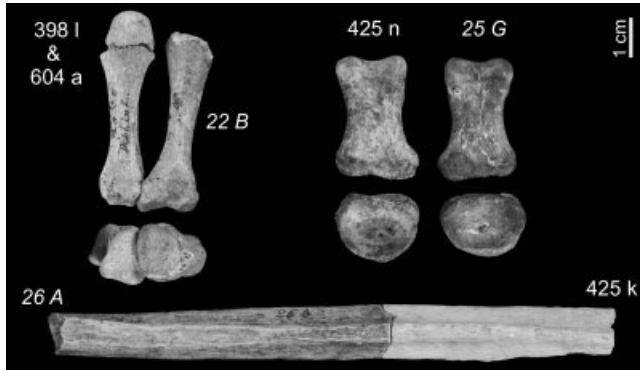
Fig. 1. Human remains from Spy directly dated to the Neolithic in the present study. Upper left: Spy 398I-604a and 22B (right third and second metacarpals, with Spy 604a being the distal epiphysis of MTC Spy 398I) in palmar and proximal views; upper right: Spy 425n and 25G (right and left first proximal foot phalanges) in plantar and proximal views; bottom: Spy 26A and 425k (right fibula diaphysis fragments) in anterior view. Specimens from the original collection are indicated in italics; newly discovered ones are in plain font.

is ambiguous. The first date obtained on the Spy 572a scapula at the Oxford Radiocarbon Accelerator Unit (ORAU) is much younger than the one provided by the Center for Isotope Research (CIO) at the University of Groningen using a sample extracted by HB (Table 1). The pretreatment method applied in Oxford at that time was essentially the same as that used in Groningen; so, it is difficult to determine the reason for the divergent results; it may relate to differential consolidation and decontamination. The contamination of the scapula through 19th century consolidation is attested by historical sources and is further supported by the slightly older age of the second date obtained in Oxford (OxA-8913) after application of a solvent extraction prior to bone pretreatment. Subsequently, an unpublished, fragmentary human vertebra (Spy 737a), discovered on the slope below Spy Cave, was directly dated to 36,250 \pm 500 ^{14}\text{C} BP (OxA-10560; Table 1; Toussaint and Pirson, 2006). Given this date, it may belong to one of the Neandertals, but it cannot be clearly associated to either of the two adult Neandertals.